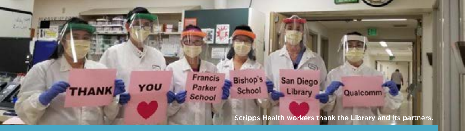
Scripps Health workers thank the Library and its partners.